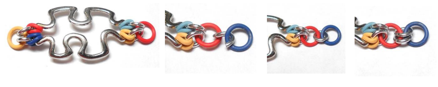
Photo \ L \qquad \qquad Photo \ M \qquad \qquad Photo \ N \qquad \qquad Photo \ O